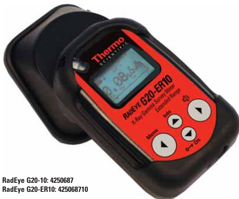
RadEye G20-10: 4250687 RadEye G20-ER10: 425068710

The RadEye G20-10 and G20-ER10 are excellent gamma survey meters with a flat energy response curve from 17 keV to 1.3 MeV according to ambient equivalent dose H^*(10) . The RadEye G20-ER10 model covers the whole dose rate range from background to 100 mSv/h.